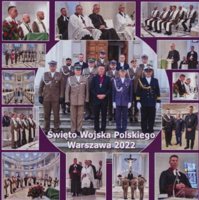
Święto Wojska Polskiego Warszawa 2022